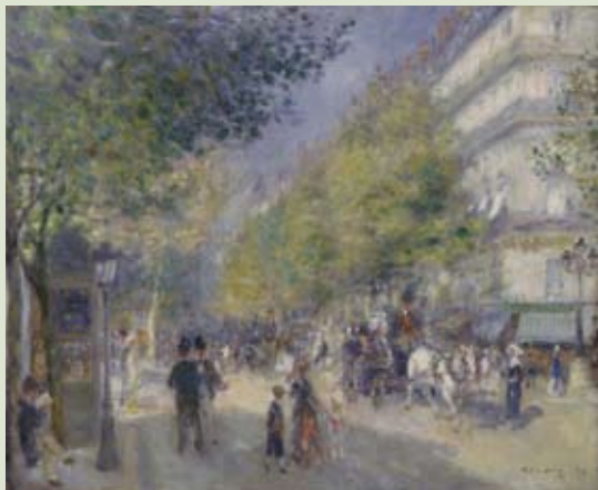
Renoir, The Grands Boulevards