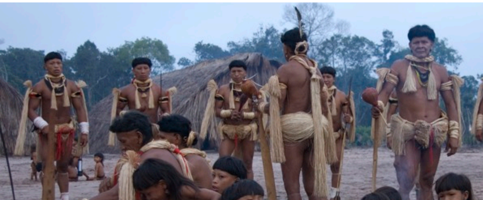
Enawene Nawe performing their annual yākwā ritual, which is linked to the fish they catch in the tributaries of the Juruena River

waves of violence against the Jummas. Most of those who were evicted for the Kaptai dam are still living in India, unrecognized by either state. Those who have remained in or returned to their territories are further threatened by a proposed second Kaptai dam, for which Bangladesh has reportedly approached the USA regarding assistance. 28 No attempt has been made to inform or consult the Jumma people about these plans.