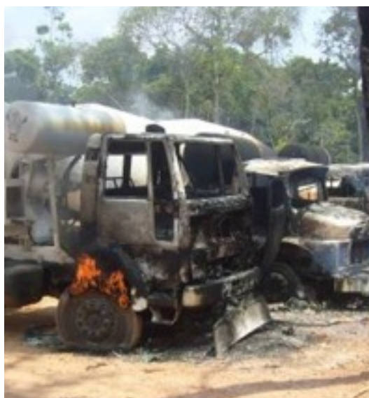
The Enawene Nawe invaded the construction site of the Telegráfica dam in 2008, destroying it.

The Protocol does not set any minimum standards for dam construction. Instead, various aspects of proposed projects are given a score between one and five. Thus a poor score for 'quality of the management planning process with respect to indigenous peoples issues, risks and opportunities' might be offset by a good score on 'transparency and competitiveness of the bidding process in awarding of contracts.' 12