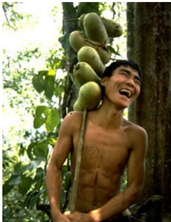
A Penan man collects jackfruit from the forest.

Enthusiasm for large dams is resurfacing, driven by the international dam lobby which is working hard to paint its industry as a panacea to climate change. The lessons learned last century are being ignored, and tribal peoples worldwide are again being sidelined, their rights violated, and their lands destroyed.