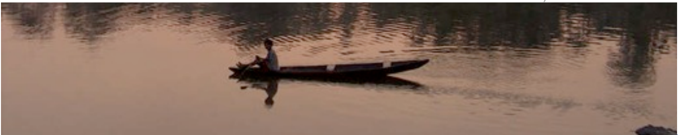
Pirahã man in a canoe. The Pirahã will be affected by the Madeira River dams

Where tribes do receive compensation it is frequently arbitrary and administered by outsiders. As many indigenous leaders have emphasized, no amount of compensation can make up for loss of land.