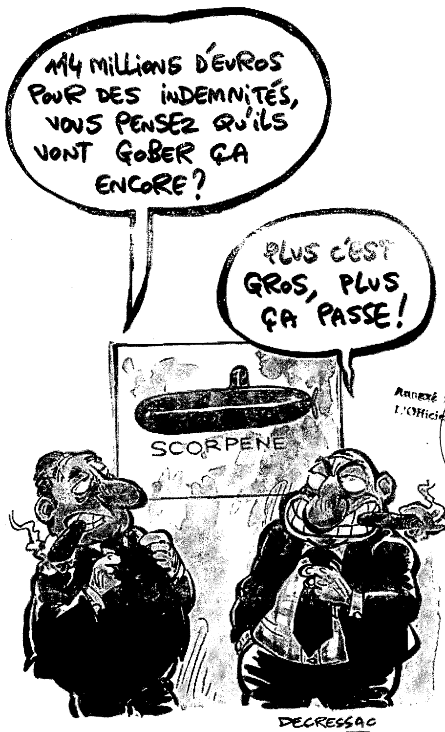
Les affaires sortent le périscope © Decressac

Et les enquêteurs de la division nationale des investigations financières ne s'en privent pas. Tout récemment ce sont les sous-marins français vendus à d'exotiques contrées qui les amènent à explorer des terra, sinon incognita, du moins lointaines.